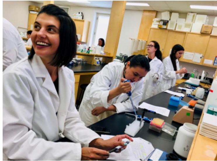
Above: SING women in the lab.