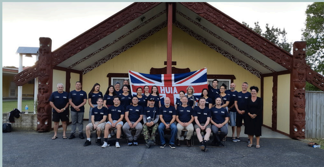
Above: Staff, speakers, and participants of SING Aotearoa 2019.