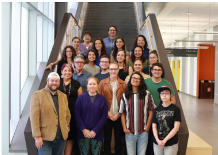
Above: Faculty and participants of SING Canada.

Fourteen participants took part this year, including undergraduate and graduate students and community members from Indigenous communities in British Columbia, Alberta, Ontario, Alaska, Arizona, and Australia.