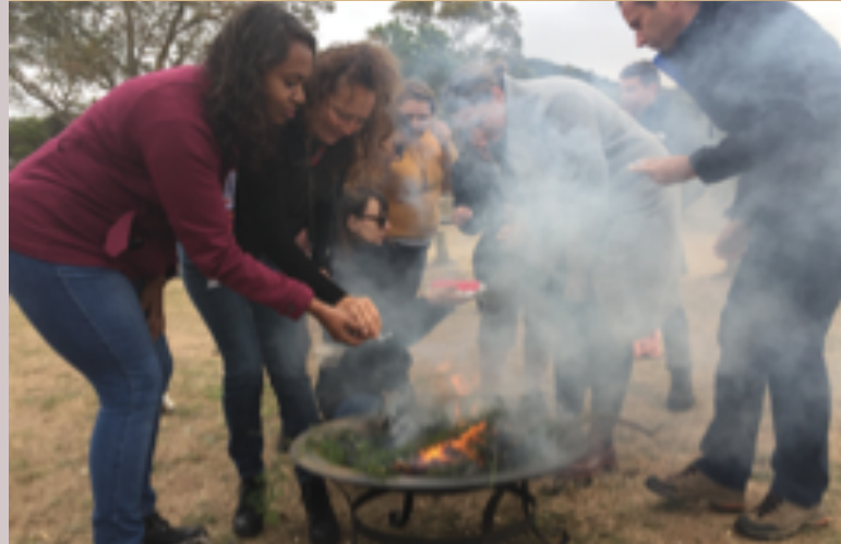
Top: SING Australia participants and faculty. Bottom: Participants pour remaining DNA extractions and samples back to the country.

Overall, 24 scholars from around Australia participated in the week-long workshop. There were 20 academics from 13 different organizations across Australia. Support for this workshop was provided by the Australian Research Council Centre of Excellence for Australian Biodiversity and Heritage (CABAH) with laboratory materials support provided by Illumina and Qiagen.