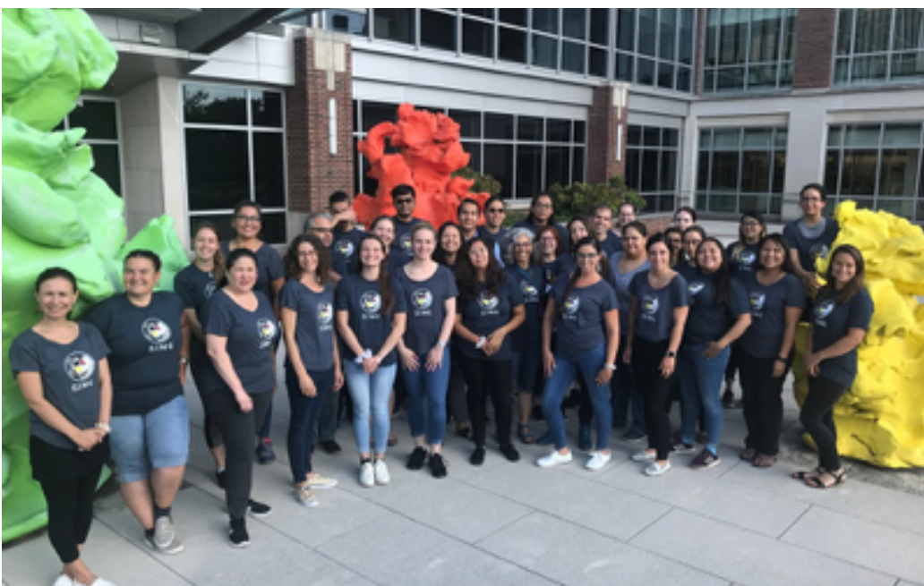
Left: SING USA 2019 workshop faculty and participants. We also welcomed members of the Kenaitze Indian Tribe.